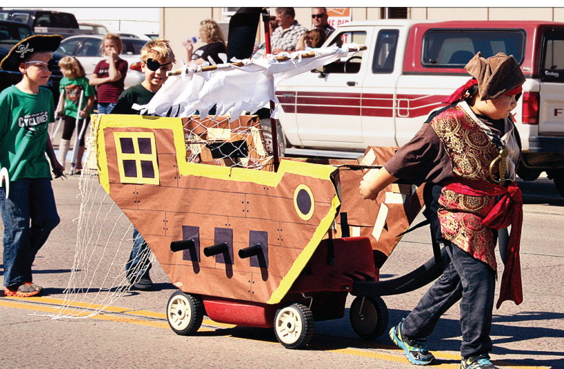
honors for the second grade elementary walking division.