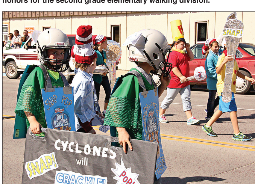
Snap, Crackle & Pop characters and football players made up the third grade entry. They earned second place honors in their division.