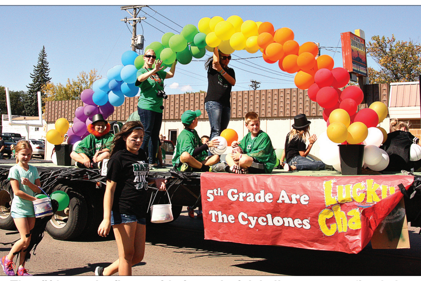
The fifth grade float, with its colorful balloons were 'Lucky' and 'Charmed' the judges, winning first place.