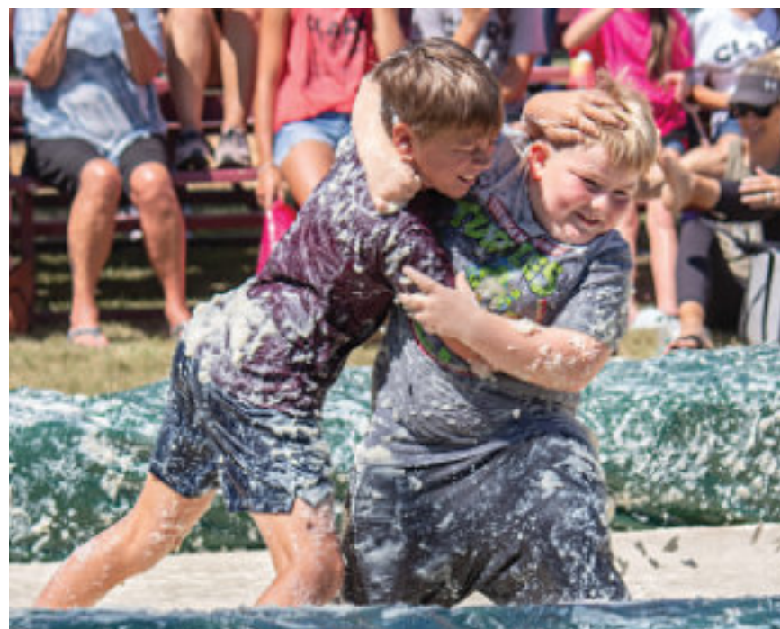
Potato Days in Clark, held in August, wouldn't be 'Potato' Days without the continued tradition of World Famous Mashed Potato Wrestling.

Clark Area 18U slowpitch softball team earned the runner-up ti-