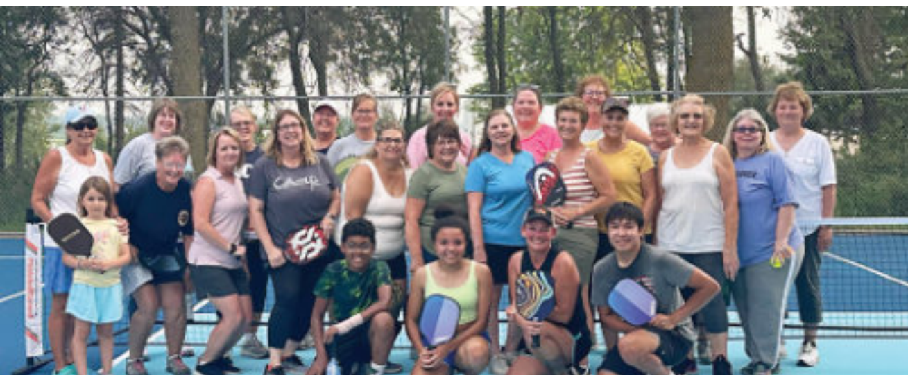
Clark is adding a new sport to their repertoire: Pickleball! Efforts to enhance the tennis court near Clark High School have been ongoing since last summer, thanks to the contributions of several individuals and local organizations.

2024 Year in Review (continued on page 8)