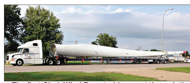
The first Clark Wind Farm turbine went through the city of Clark in September enroute to its new home six miles north and a mile and a half west of Clark.

✪ Many towns have Memorial Day observances, hon-