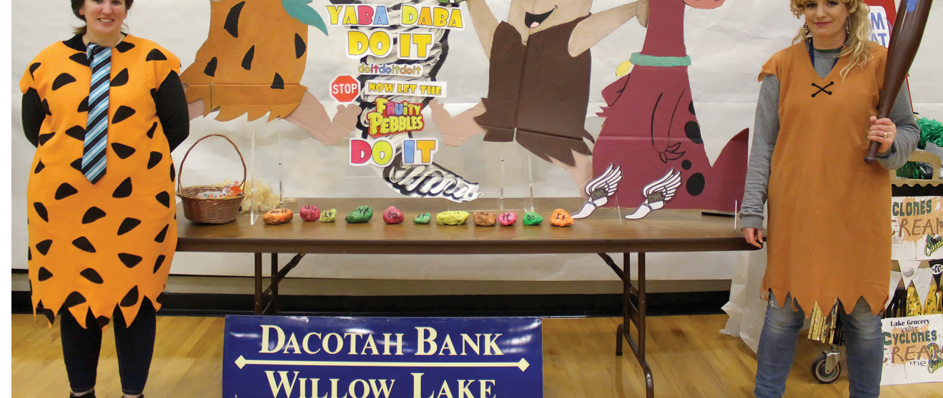
YABA DABA DOIT STOP NOW BUY THE FRUITY PEBBLES DOIT