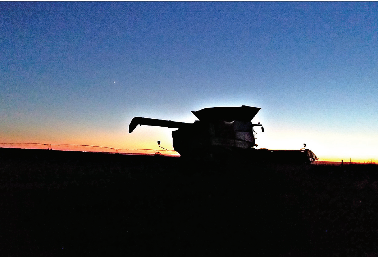
It is that time of year when one 'Fall Back', scrapes off of windshields and sees combines go late into the night. Bader, just west of Clark. He thought Venus was noticeable as the brightest star, to the left of the combine.