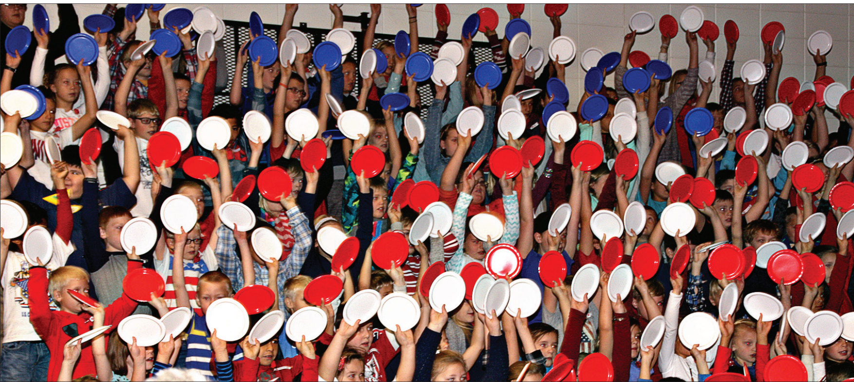
Patriotism at its finest is on display at Veterans Day school programs all throughout America. At Clark School Friday, students in grades K-6

Clark Flower & Gift (continued on page 3)