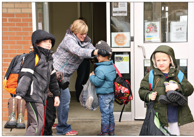
January weather, had a little bit of everything. The first week of the new year saw five times the low in double digits below zero. School was canceled several times during the month.