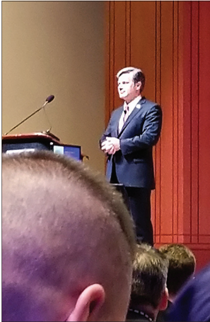
FBI Director Christopher Wray spoke to the police convention delegates.