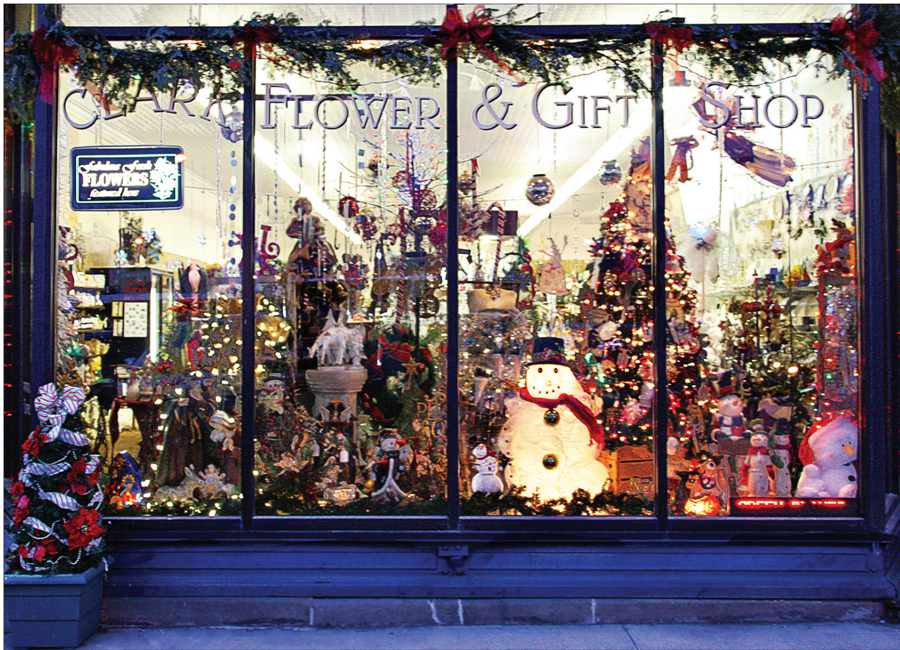
The frosty weather can't keep Frosty away. In the front window of the Clark Flower and Gift Shop, several snowmen look out on Commercial street, perhaps planning to make a break back to a more compatible environment.

"With Christmas ornaments, gold is making a comeback after silver being a huge hit in recent years. Bright colors and hot colors are a trend, for instance lime green and red versus the traditional Kelly green or Christmas green and red used for decorating. The lime green used makes it a little brighter. Repurposed old windows decorated for Christmas are popular like the ones in our front window. We know our customers and what they like, so that helps in ordering what people