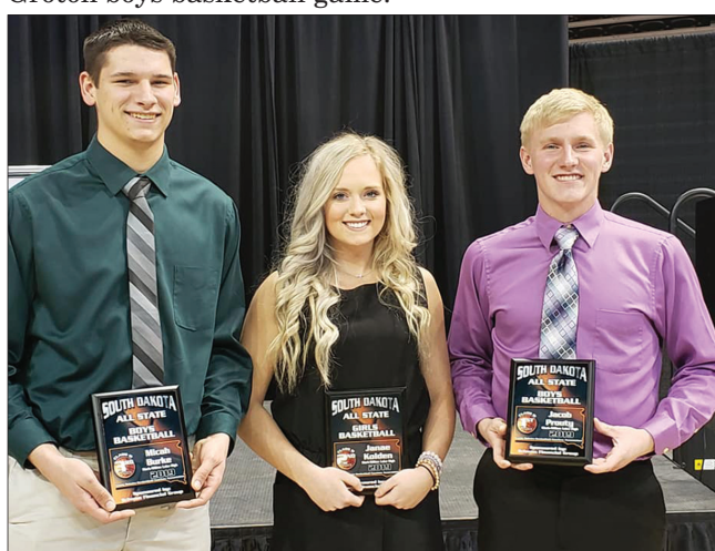
The Clark-Willow Lake Cyclones have three 2019 South Dakota Class B Basketball All Staters. A Sanford Pentagon All State Banquet was held in Sioux Falls.

At the end of January, the Cyclone boys and girls, collectively, are 21-4 on the season, as the boys suffer their first loss to eventual Class A State champion Tea.