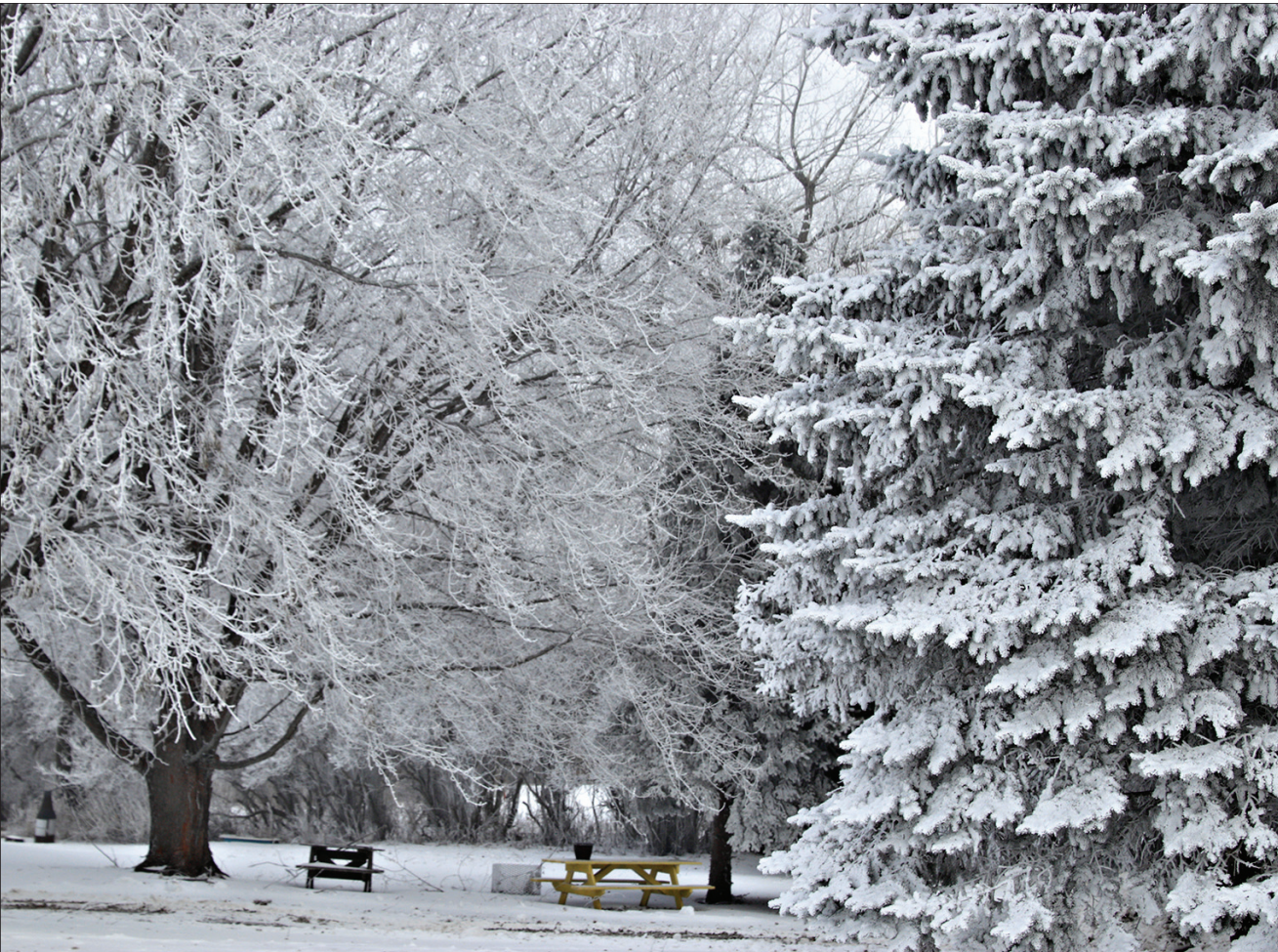
If one didn't have a White Christmas, there certainly will be a White New Year's. Starting Friday night and lasting into Monday morning, a winter snow storm and blizzard conditions at times, blanketed the county and northeast South Dakota.