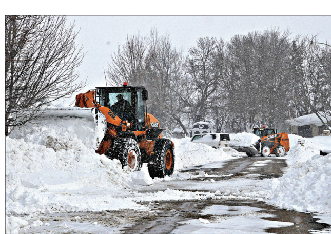
Snow removal was going fast and furious after more than two feet of snow, or at least in that neighborhood, fell in Clark County.

Heavy, thick snow, moved by two days of vicious winds, made snow removal a challenge as where all this snow should go.