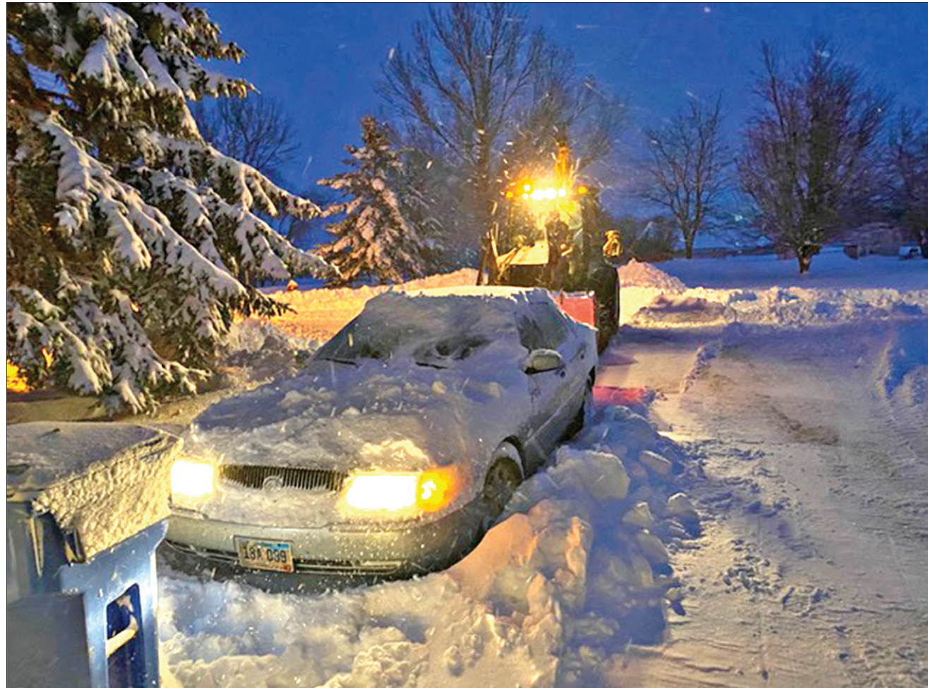
The picture above left shows the pogonip frost that was seen last week prior to the storm. The picture at right shows the Forest Excavating snow crew cleaning out the driveway so the press car can get the editor to work to help begin the process of getting the paper finished Monday morning to get in mailboxes by Tuesday.