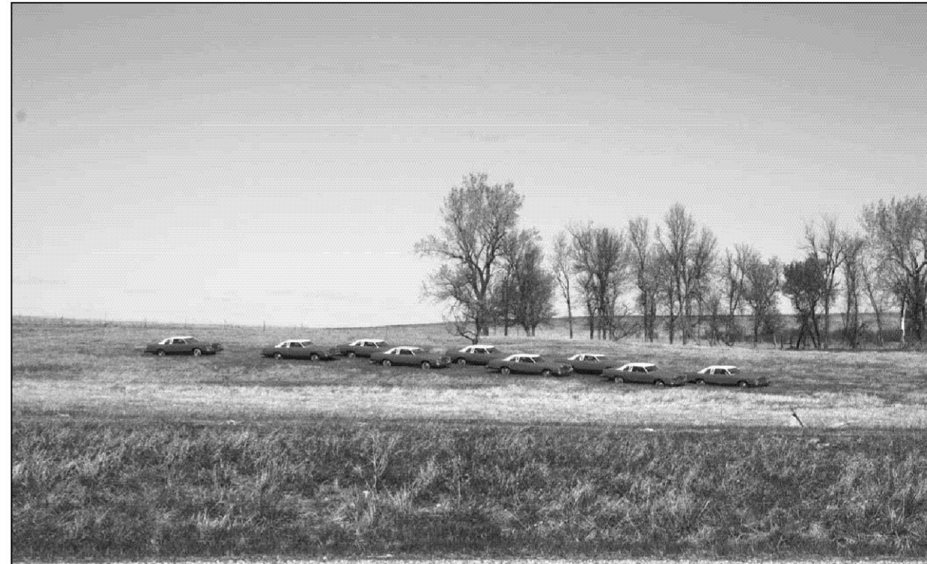
a small pond as Clark County precipitation was only 3.31" from October of 2011 to April 1 of 2012. Last year the precipitation amount was double during that time measuring 7.82" and the snow remained deep throughout the winter. Nine cars are in 'The Parade' this year. Were nine cars there last year in the parade - maybe? maybe not.