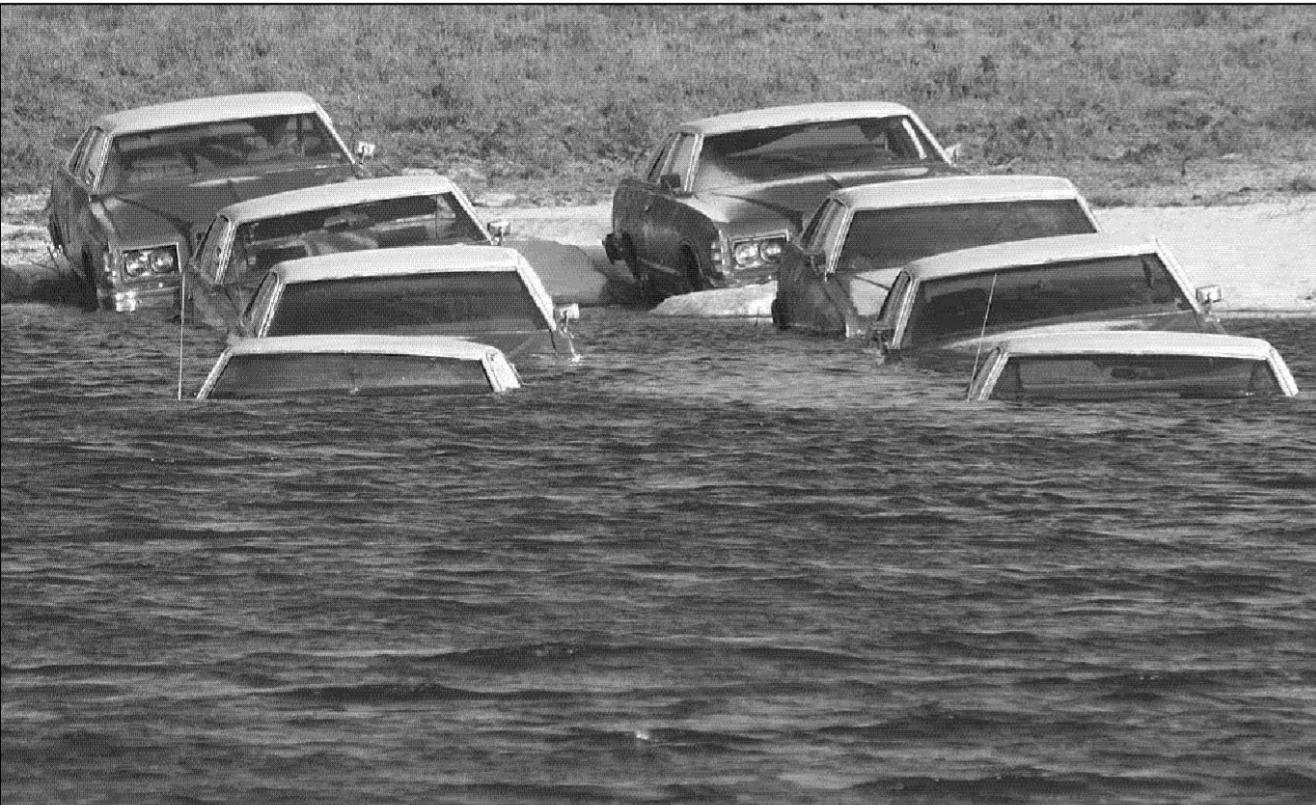
With 70 plus inches of snowfall as of April 13 in 2011, this was just one of the results last spring in Clark County. Snow melt nearly covered up the front two ford LTDs in 'The Parade' of cars located in the pasture of Ken Bell west of Clark in his field of sculptures.