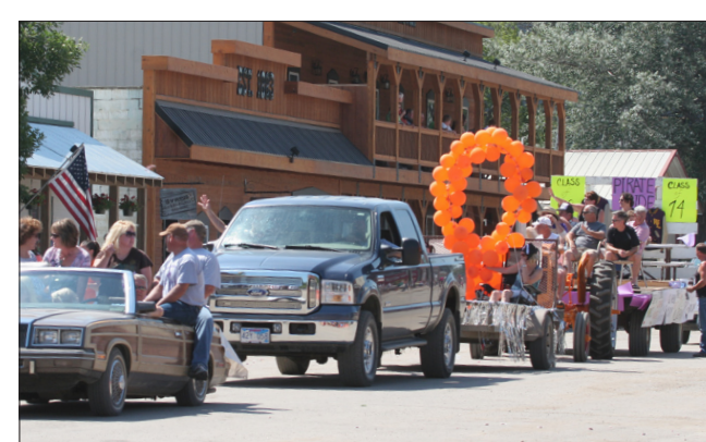
With the newly opened Home Town Hotel in the background, the Willow Lake High School 100th Annual All-School Reunion Parade was held July 8.