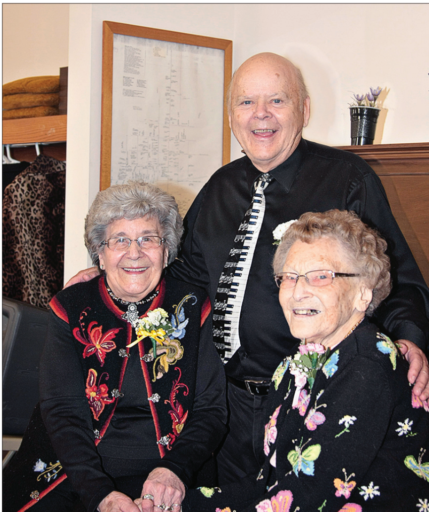
Not always when one turn 100 years young does that guarantee front page pictures for two consecutive weeks.

All interested persons are invited to attend and participate in the Easter feast preparation week.