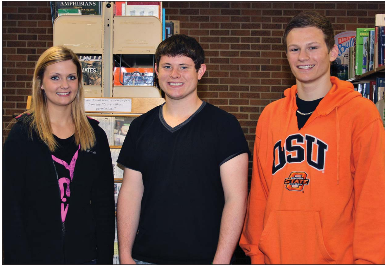
Boys and Girls State representatives were recently selected at Clark High School. Boys State is held on the Northern State University campus in Aberdeen and Girls State is held at the University of South Da-

The dance will take place from 9:00 to 11:00 p.m. at the gym. The after prom party will be held at the Rec Center in Watertown.