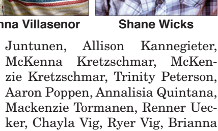
The 2021 class motto is "It's what you do right now that makes a difference." The class colors are navy, black and silver and the class flower is a sunflower.