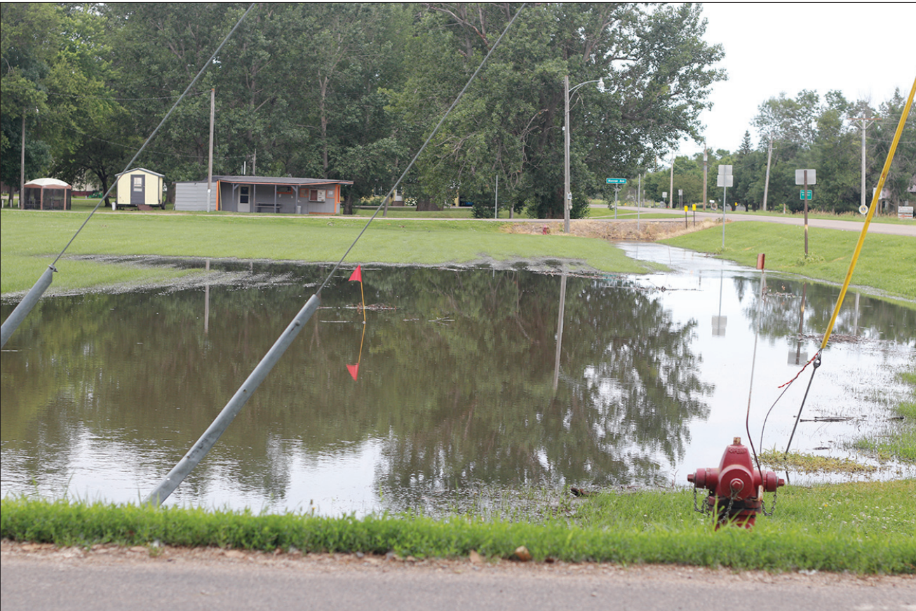
Three inches of rain is a lot at one time on top of ground that's already adequate in moisture. This was the scene at the Willow Lake football practice field along Grant Avenue and U.S. Highway 28.