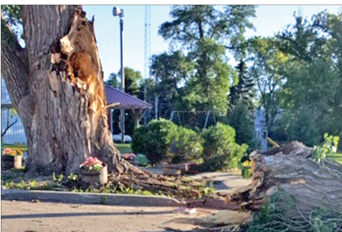
This is the sad sight for Henry residents as of Sunday evening. Their 138 year old oak tree on Henry's Main Street lost the 'north arm' portion of the tree at approximately 5:30 p.m. on Sunday evening. It missed all seven of the flower pots surrounding it,

but took out a street light along the sidewalk and fortunately no one was hurt.