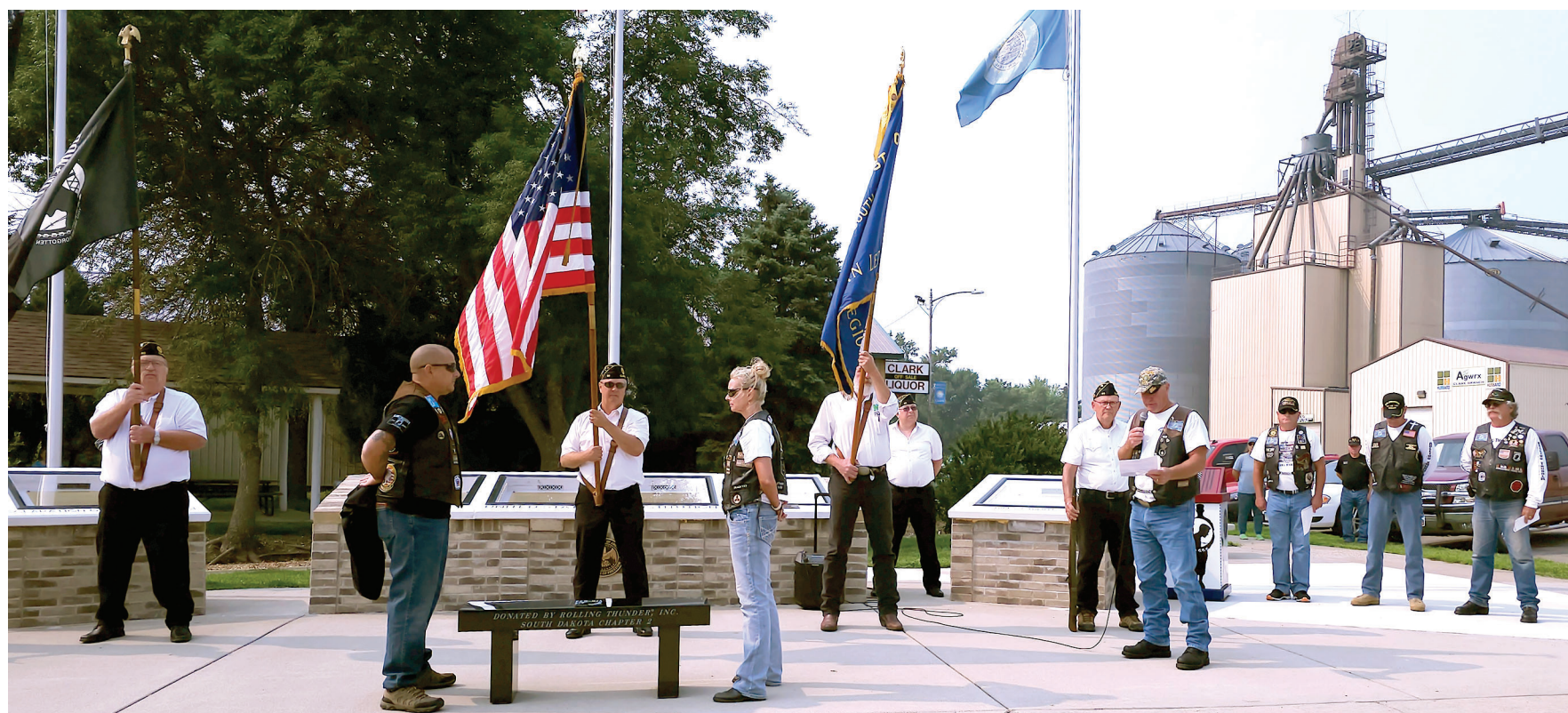
People gathered Saturday morning at Flat Iron Park in Clark to witness the Prisoner of War Bench Dedication ceremony by Rolling Thunder®, Inc. Chapter 2 South Dakota and Clark American Legion members. The

The lunch stand will be open for attendees and spectators to utilize for meals and snacks throughout the weekend, and there will be no gate fees to come watch the rodeo. The concessions will be hosted by Clark County 4-H families and leaders.