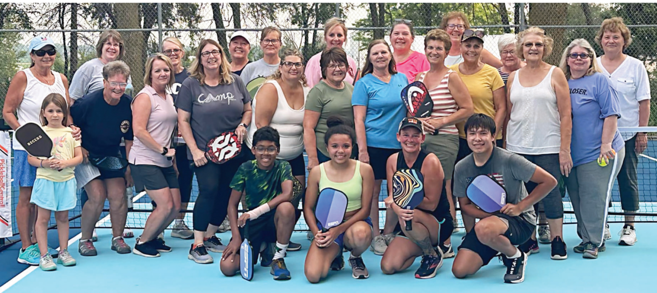
A Pickleball Clinic for beginners was held at the newly finished pickleball court near Clark High School on Monday at 6:00 p.m. Those in attendance are pictured above.