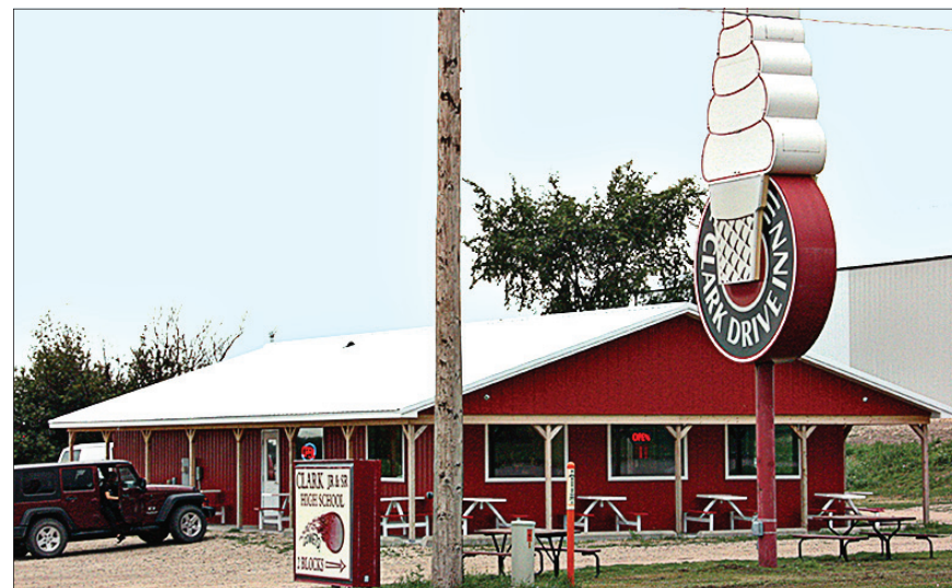
DB Barbecue & Drive-In