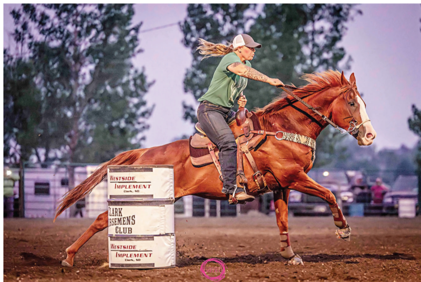
The National Barrel Horse Association SD 04 district competition was last Tuesday, July 23, 2024 at the Clark County Fairgrounds. Riders and their horses from the counties of Brookings, Brown, Clark, Codington, Day, Deuel, Grant, Hamlin, Marshall, Roberts and Spink showed up to prove their worth.

On Wednesday, August 7, the display exhibit building opens at 8:30 a.m. The dairy, beef builder and beef show begins the day at 9:00 a.m. followed by the county livestock judging contest at 12:00 p.m. The Senior showmanship round robin contest will begin at 2:30 p.m.