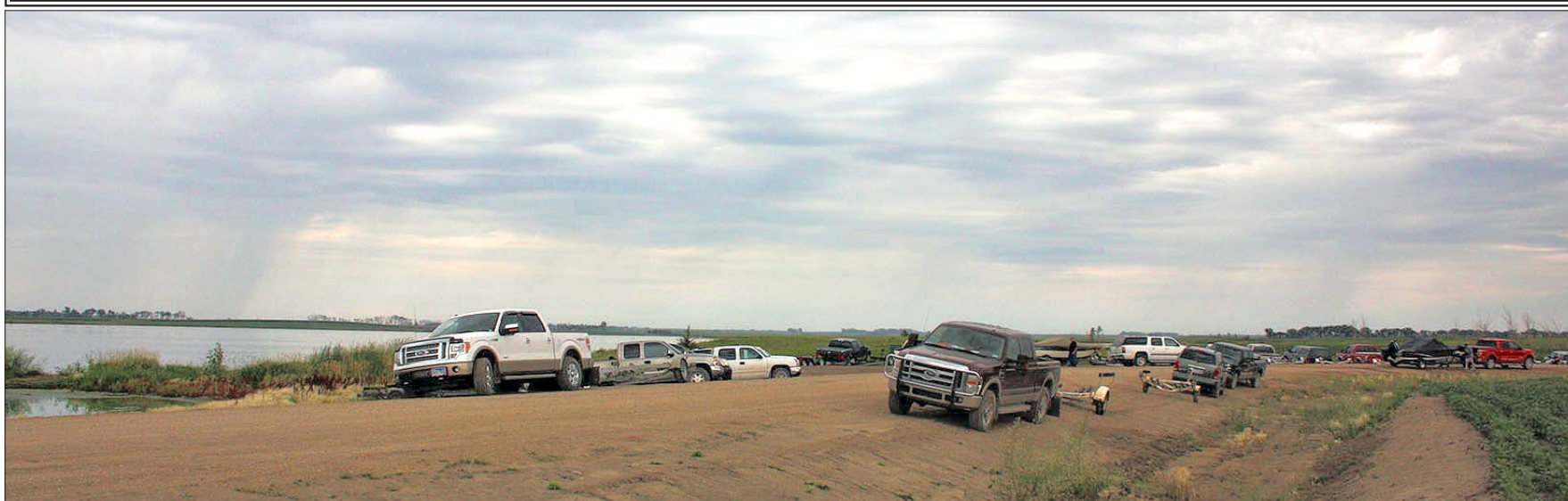
This is the common scene this summer at Dry Lake #1. Many pickups line the roadway by Dry Lake #1, located near the Hillcrest Hutterite Colony. Fishing has been active to this point in Clark County this spring