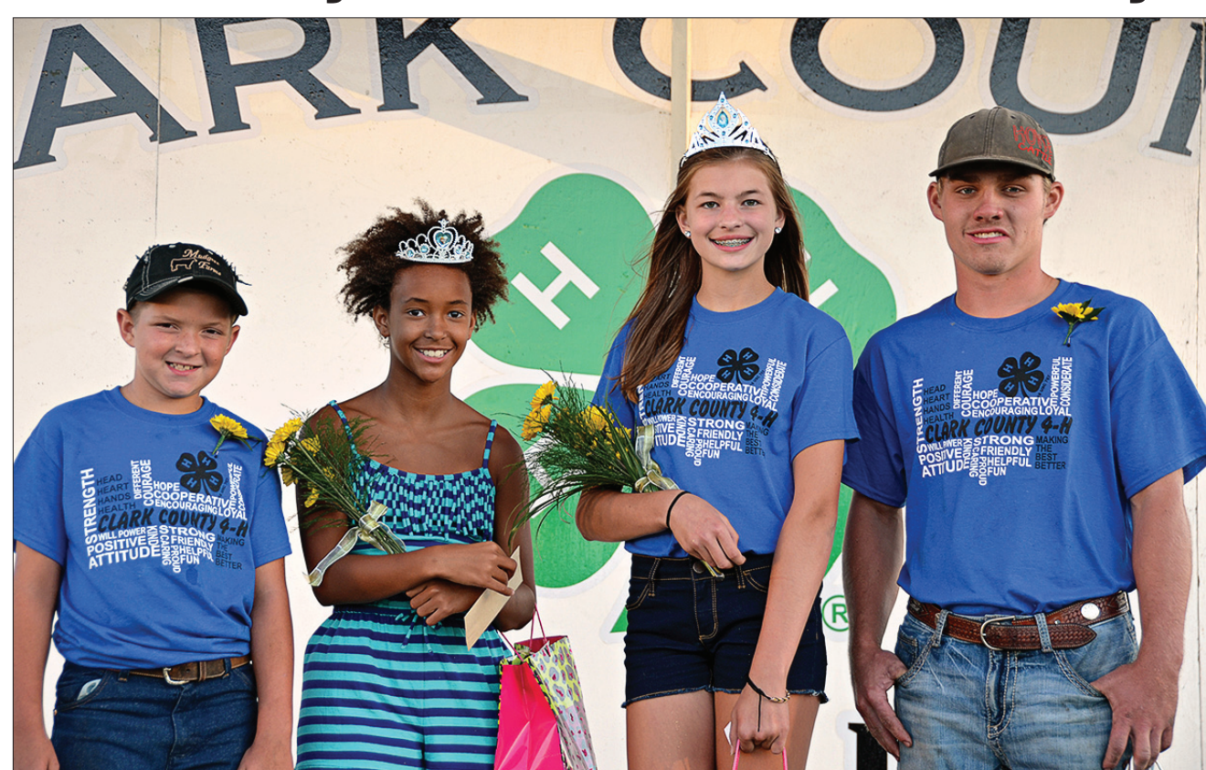
The Clark County 4-H Junior Leaders brought back the crowning of 4-H Royalty this year, after an absence of over 50 years.

4-H Achievement Days (continued on page 3)