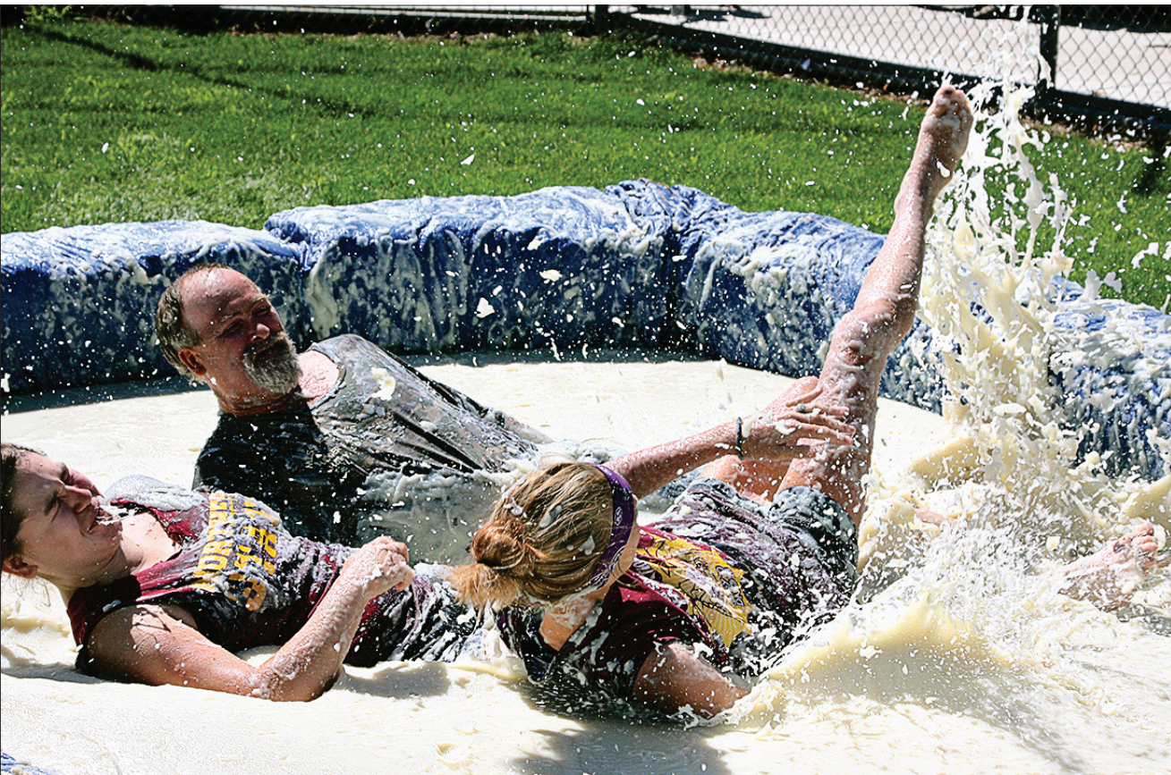
A nice crowd at Dakota Style Field in Dickinson Park, under gorgeous weather conditions, witnessed some entertaining Potato Day wrestling matches.