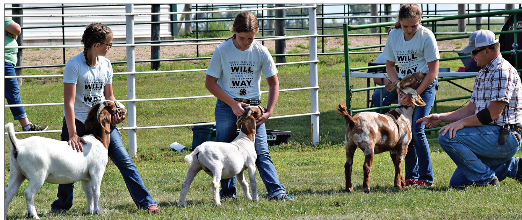
Achievement Days went on, but much different than usual. With no spectators, no static exhibits, only livestock shows went on in 2020. During the goat portion of livestock judging, from left to right Coy