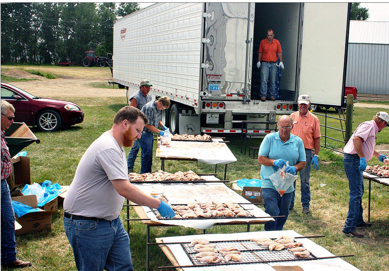
Chickens, chickens and more chickens! Every year the Clark County 4-H Chicken Barbecue is a large undertaking, serving 800 meals, by the Clark County 4-H Leaders. The weather cooperated nicely this year making the chicken dinner and the 4-H Achievement Days a big success.