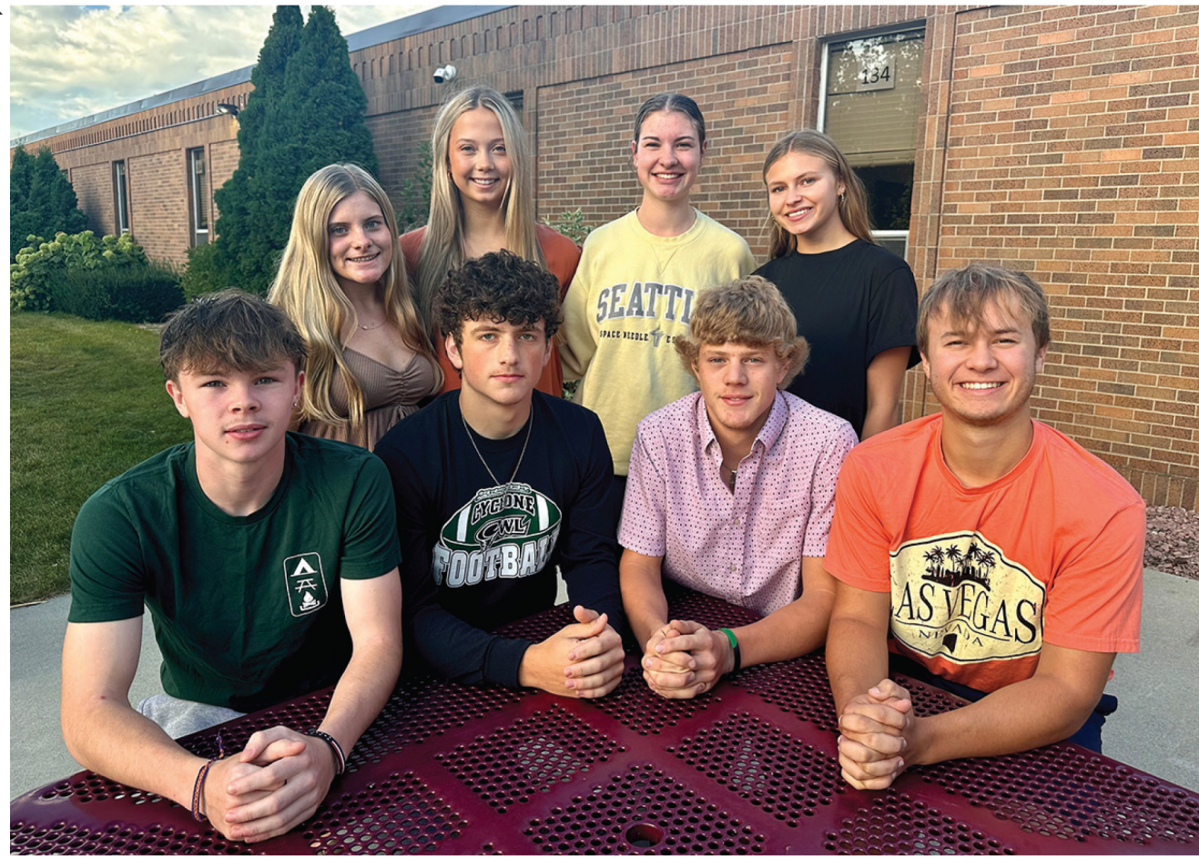
The 2024 Clark High School Homecoming royalty candidates have been announced. Coronation is scheduled for Tuesday, September 24 at 7:00 p.m. in the Clark High School gym.