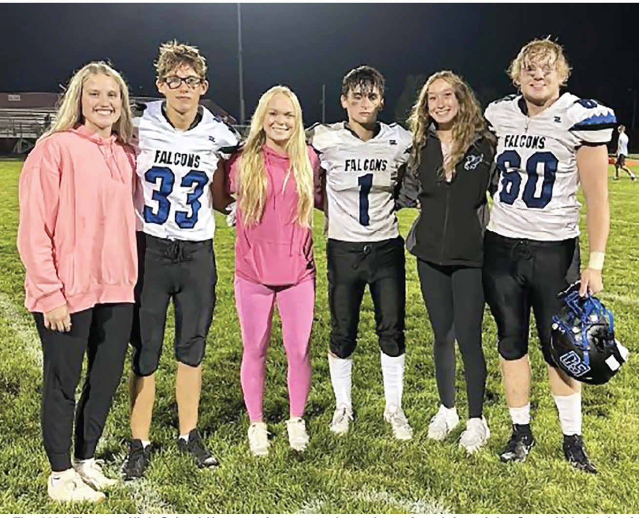
The 2024 Florence High School Homecoming royalty candidates have been announced. Coronation is scheduled for Monday, September 23 at 6:30 p.m. Homecoming Royalty candidates are pictured in the