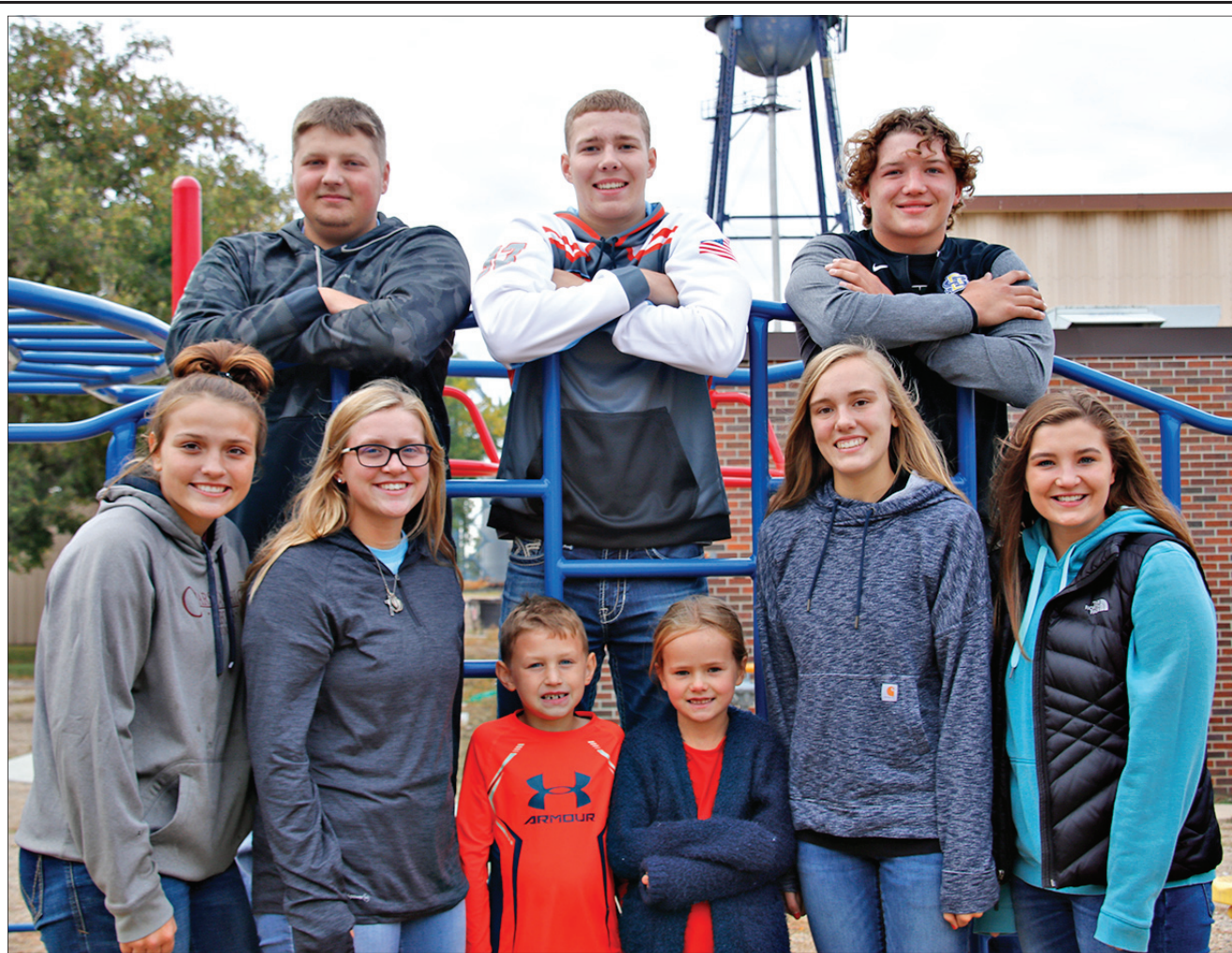
The 2020 royalty candidates for the Willow Lake Homecoming have been selected. Coronation is on Monday, October 5, at 7:30 p.m. in the high school gym.